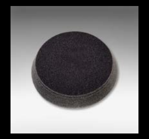
Polishing disc black, siafast Ø 145 mm