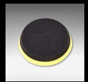
Polishing disc yellow, siafast \emptyset 145 mm