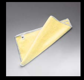
Microfibre cloth Cleaning cloth 380 x 380 mm