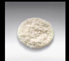
Lambskin disc, siafast