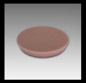
Polishing disc brown, siafast