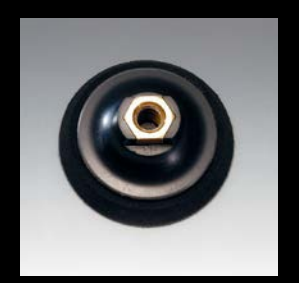
Backing pad, M14 Ø 125 mm: Art. ID